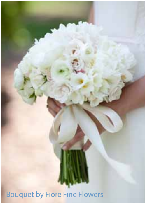
Bouquet by Fiore Fine Flowers