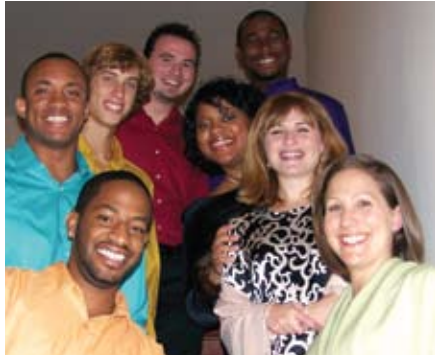
The Ray Kennedy Opera House Theatre Company